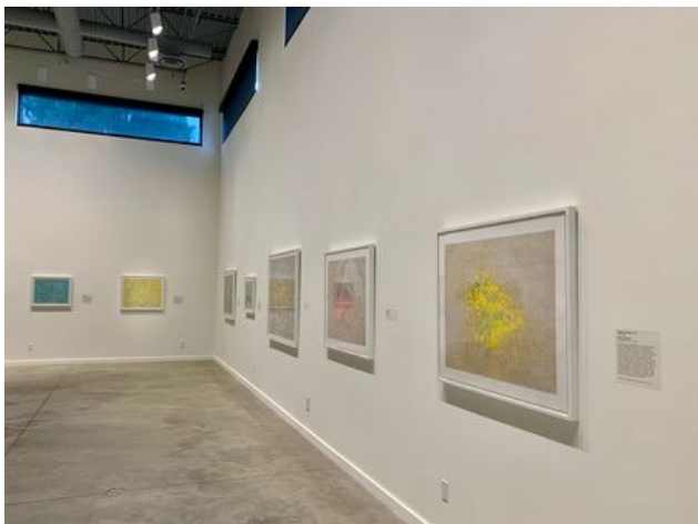
An installation shot of the Aaron Rothman exhibition at the Transformer Station gallery in Hingetown.

As a result, he creates infinitely complex patterns of light, color and texture that frustrate and complicate the eye's typical ability to separate the objects in a field of vision from the surrounding background — a phenomenon known as figure-ground.